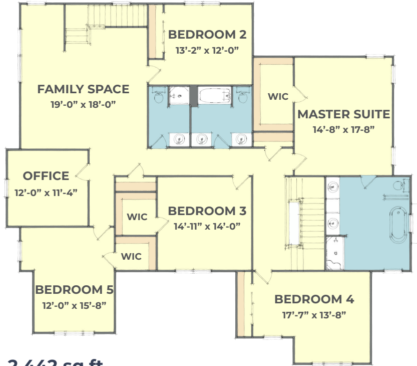
2,442 sq.ft. Second Floor