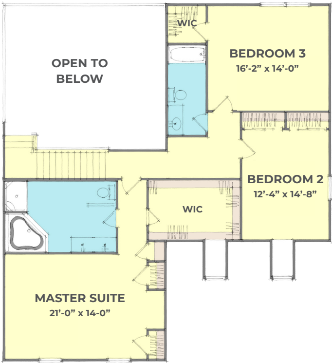
1,298 sq.ft. Second Floor